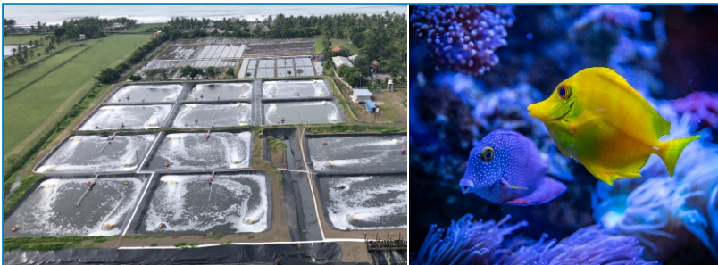
Seawater typically has an EC value of 50–55 mS/cm