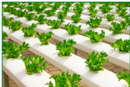
Hydroponics Typically 0.5 ~5 mS/cm

Seawater typically has an EC value of 50–55 mS/cm, far exceeding the 20 mS/cm limit of standard hydroponic meters. To accurately measure the EC of seawater, a specialized high-range EC meter is required, capable of measuring up to 200 mS/cm or higher.